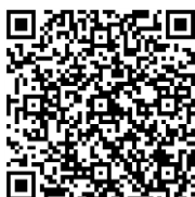
QR code for the Presidents's Survey