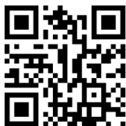
QR code for Conference webpage

Conference Evaluation: https://www.surveymonkey.com/r/Eval2019Iceland